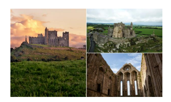
Tuesday July 9 to Tuesday July 16, 2024